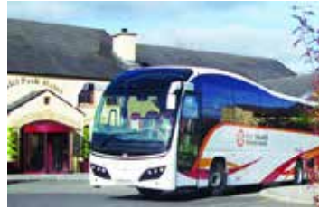
Left to right: View of the Ring of Kerry, Dublin, CIE Coach Bus