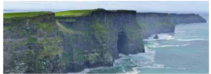
Cliffs of Moher