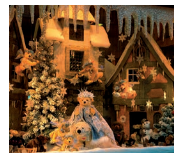
Christmas Windows, Rotheburg