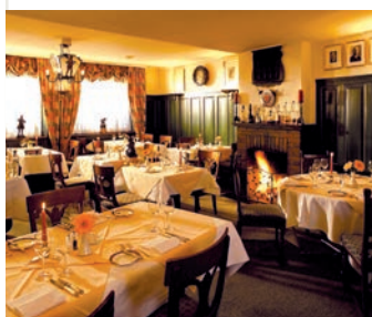
Hotel Wilden Mann, Restaurant