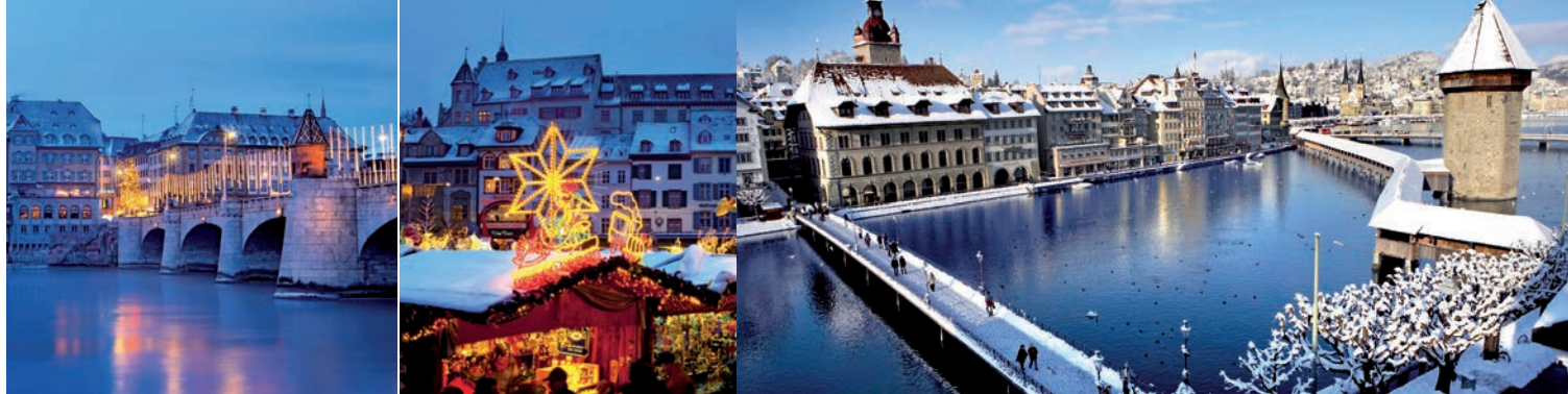
Left: Lucerne in Winter © Luzern Tourism;