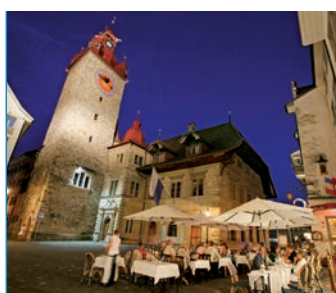
Old town of Lucerne

LUCERNE This town is one of the loveliest cities in Switzerland! It is the storybook image of a Swiss town, abounding in cobblestoned streets, historic spires and turrets, covered bridges, frescoed houses and fountains. A visit to Mt. Titlis, Mt. Pilatus or Mt Rigi is also highly-recommended!