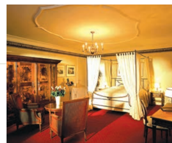
Hotel Wilden Mann, Superior Room