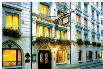
Hotel Wilden Mann, Exterior

Hotel located in the picturesque Old Town. Individually-decorated rooms with a traditional feel, linked with modern comfort, combine with the outstanding cuisine of its restaurants to create a home-away-from-home atmosphere!