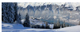
Winter in Interlaken

This package is not to be used in conjunction with any other offer.