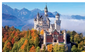
Neuschwanstein Castle © Beyer