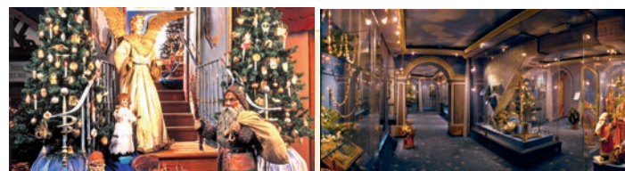
Christmas Museum