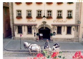
Hotel Eisenhut: Exterior