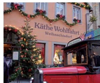
Käthe Wohlfahrt Christmas Museum