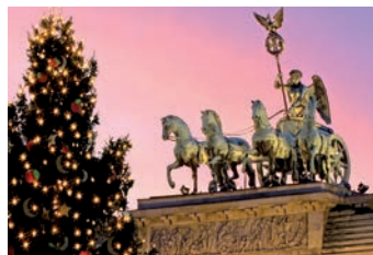
Brandenburg Gate in Winter