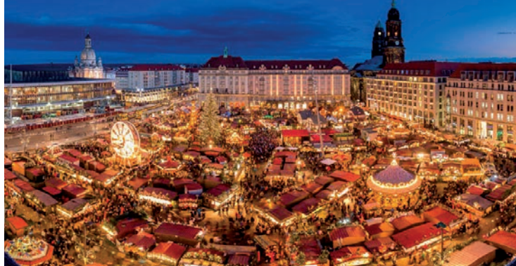
Left-to-right: Rothenburg de Tauber; Dresden Striezelmarkt (Christmas Market)