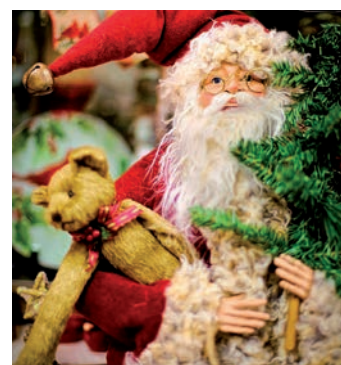
Dresden Christmas Markets