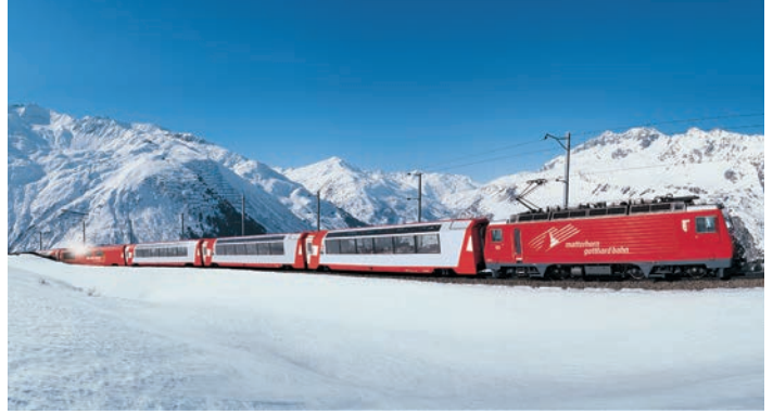
The Glacier Express