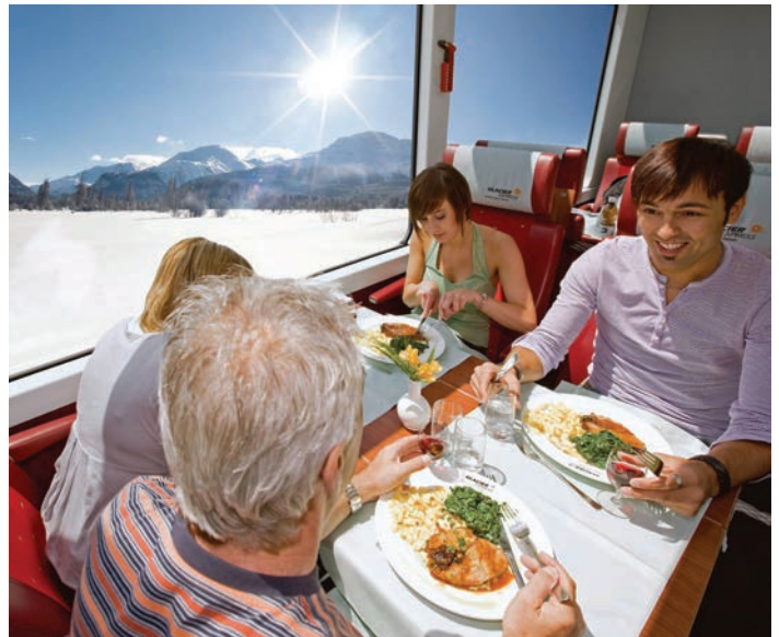
Glacier Express: 1st Class car