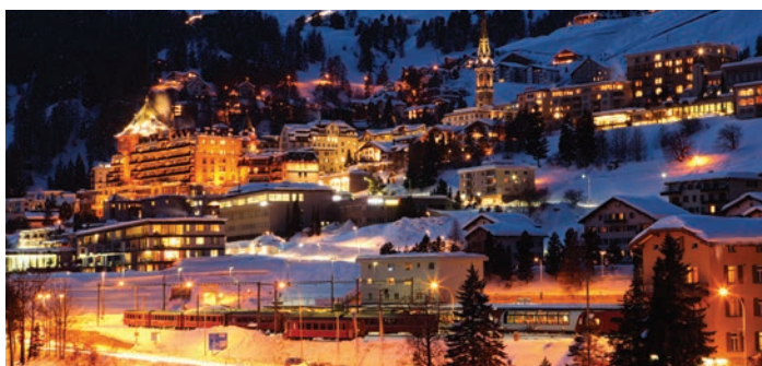
Glacier Express: St. Moritz at night