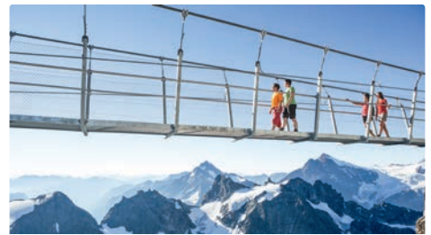
TITLIS CLIFF WALK Europe's highest suspension bridge