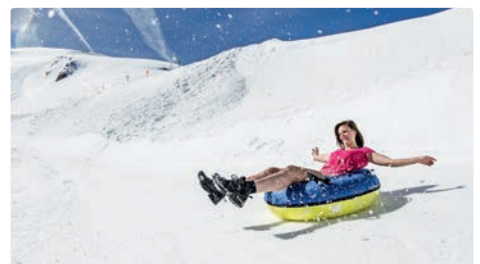
TITLIS GLACIER PARK Slide down a hill on a snow tube