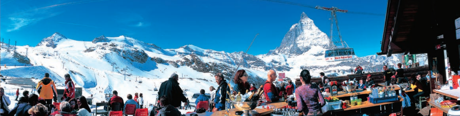
Restaurant at the base of the Matterhorn