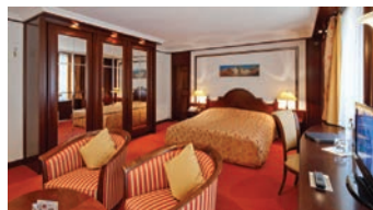
Classic double room

Located in the heart of the village. 400 metres from the railway station. Offering 66 luxurious rooms with wellness facilities and free Wi-Fi. Restaurant, piano bar and a lounge with a mountain-view terrace. The spa offers an indoor pool, 2 hot tubs and a sauna, plus Matterhorn views.