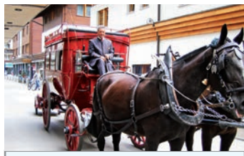
Horse and carriage in Zermatt

To prevent air pollution which could obscure the town's view of the Matterhorn, the entire town is a combustion engine car-free zone.