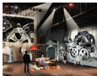
The Studio and The Manoir The Studio

PRICES ON APPLICATION CALL RESERVATIONS ON 1300 65 10 65