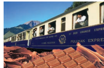
On board the Chocolate train