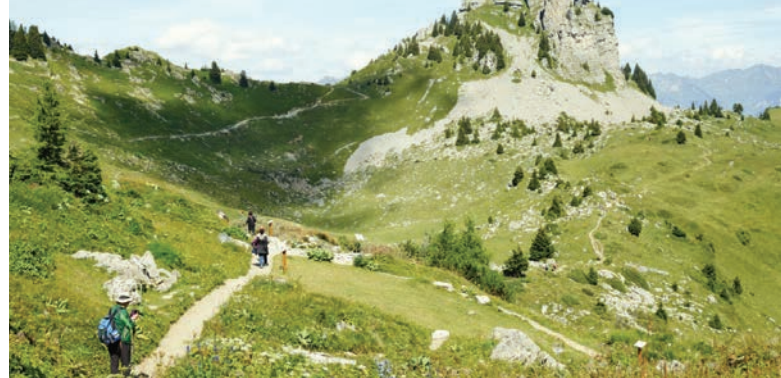
Left-to-right: Eiger Walk in Summer; Schynige Platte - Walking to Oberberghorn