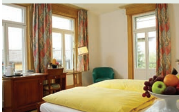
Hotel Carlton-Europe, Bedroom

Centrally located, 200m from Interlaken East Railway Station at the quiet end of Höheweg, Interlaken's famous high street. 75 uniquely-furnished rooms all with private facilities, radio, TV, telephone, hairdryer and wireless internet connection.