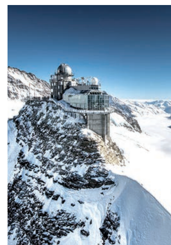
The Sphinx at Jungfrauoch