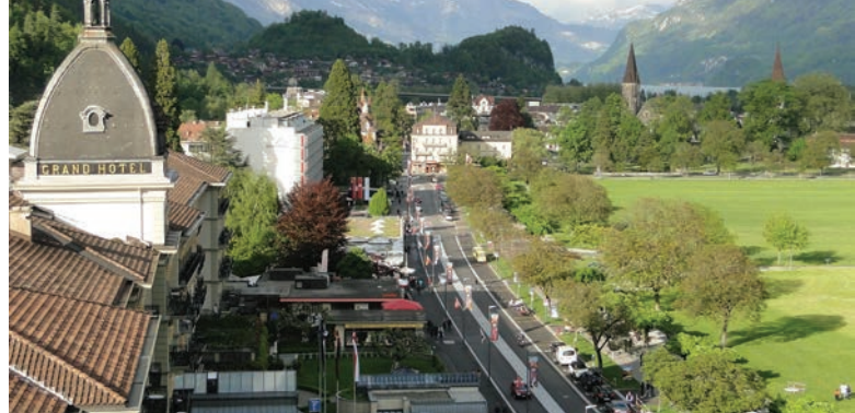
Left-to-right: View over Interlaken in Autumn; Streets of Interlaken