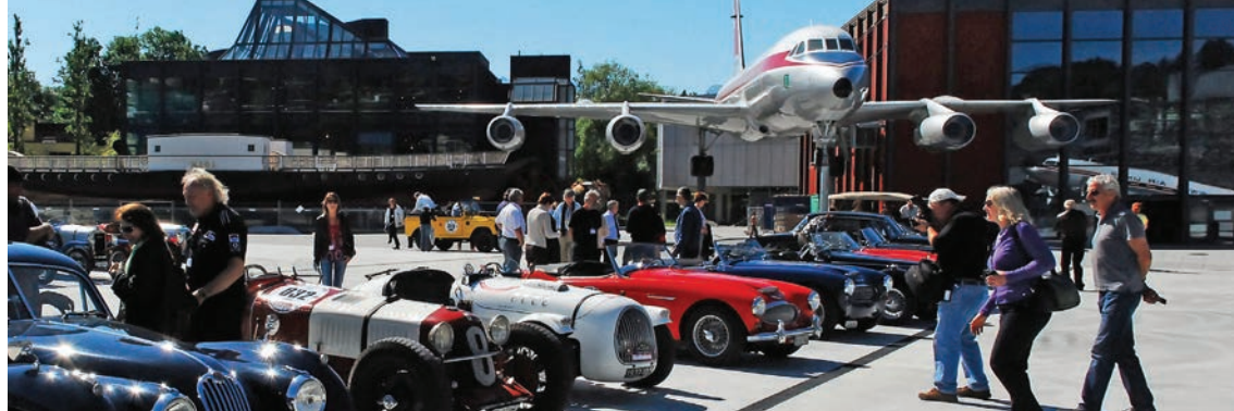
Left-to-right: Exterior of the Waldstätterhof Hotel; Swiss Transport Museum