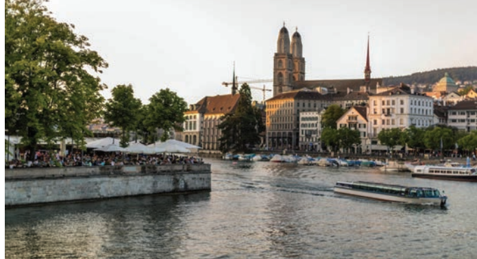
Left: Zurich on the Banks of River Limmat, Right: Zurich at Dawn