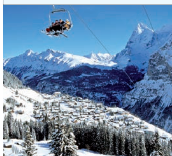
Mürren in winter

Another natural phenomenon is the Trümmelbach Falls in the 'Black Monk' mountain, hidden behind mighty rock faces. Up to 20,000 litres of water per second cascade over the ten glacier falls from a total height of about 200 metres.