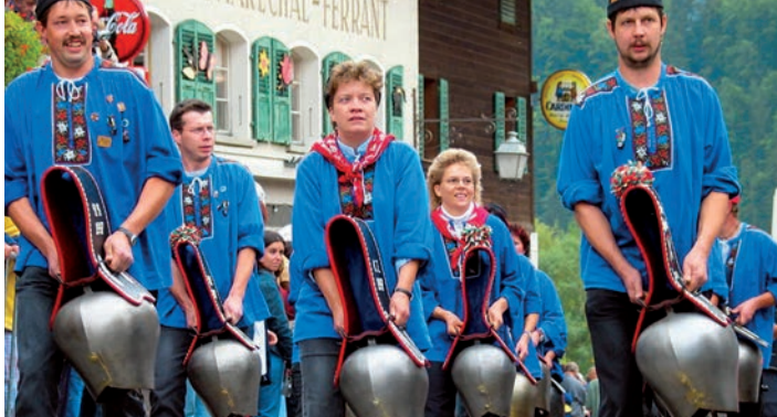
Left-to-right: Trychel (cowbell) procession in Gruyères © La Gruyères tourism; Lugano lakeshore © STS swiss-image.ch.