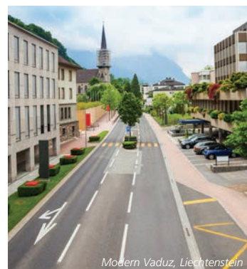
Modern Vaduz, Liechtenstein

As the tour ends late in the day, consider pre-booking a night in Zurich or other arrangements.