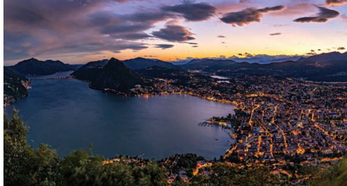
Left-to-right: St Moritz © swissimage.ch; Lugano © swissimage.ch