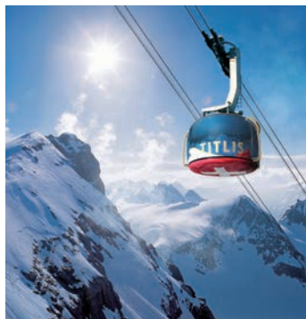
Mt Titlis gondola