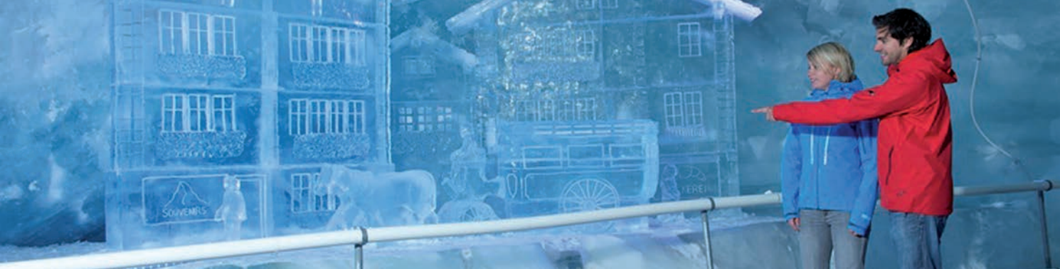
Glacier Paradise at the Gornergrat