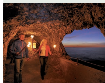
Mt. Pilatus