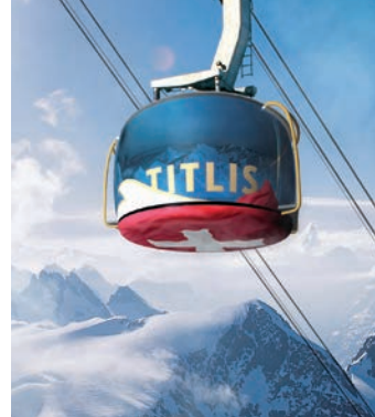
Left-to-right: Mt Rigi conductor; Glacier Express; Mt Titlis Rotair