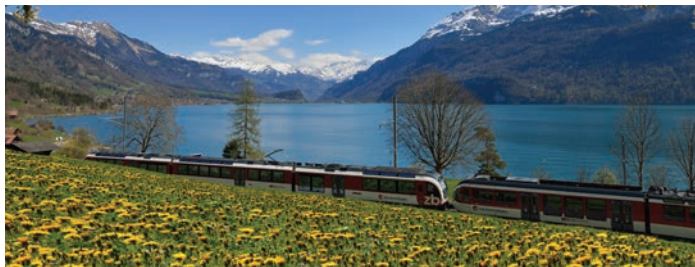
Lucerne-Interlaken Express