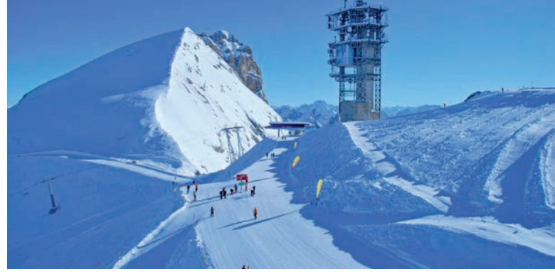
Mt Titlis