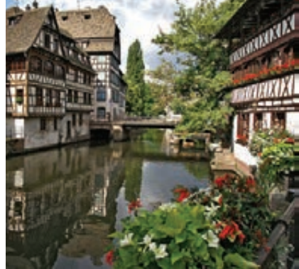
Left-to-right: Basel on the Rhine River; Freiburg Minster; Strasbourg