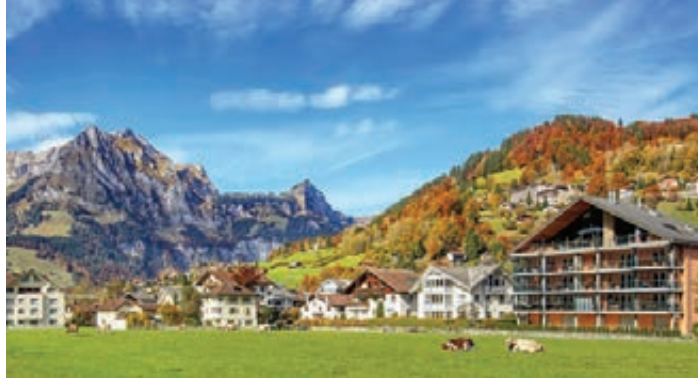
Left-to-right: Gondola to Mt Pilatus ; Engelberg; Mt Titlis Rotair Revolving gondola.