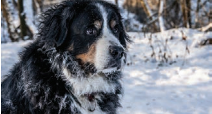
Bernese Mountain Dog; Harder Kulm, above Interlaken © STS swiss-image.ch.