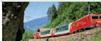
Glacier Express

It was on June 25, 1930 that the Glacier Express commenced summer operations from Zermatt to St.Moritz, but it was to take more than 50 years before the trains were able to also cross the impassable Furka alpine route in winter. Construction work on the Furka tunnel between Oberwald and Realp began in 1973 and services could finally start on 26 June 1982, allowing the Glacier Express to run year-round.