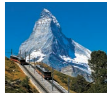
Gornergrat Railway

As the tour ends late in the day, consider pre-booking a night in Geneva or other arrangements.