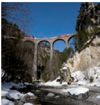
Glacier Express on the Landwusser Viaduct