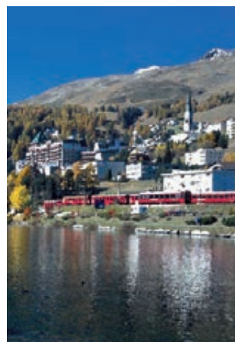
View of St. Moritz