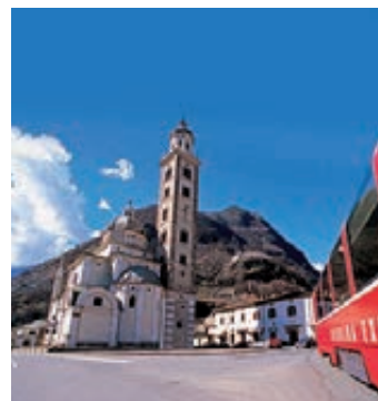
Bernina Express at Tirano