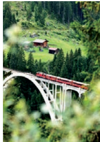
Train on the Langwieser Viaduct, near Langwies

Travel to Swiss border or international airport rail station or continue your stay in Switzerland by own arrangements. (B)