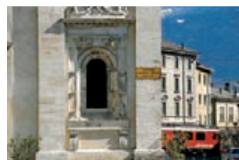
Bernina Express at Tirano

Prices are per person in Australian Dollars and are subject to currency fluctuation.