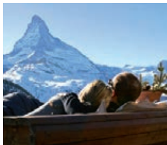
Enjoying the view of the Matterhorn