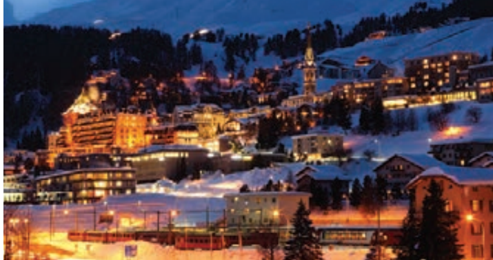
Left-to-right: Glacier Express; St. Moritz at Night