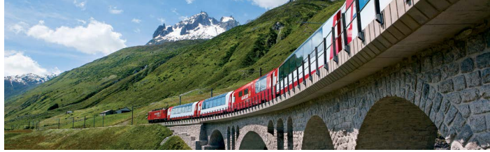
Glacier Express