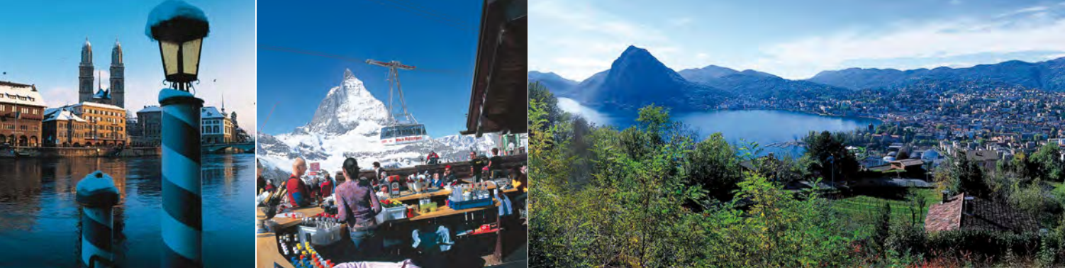
Left-to-right: Zurich, Zermatt, Lugano, Milan