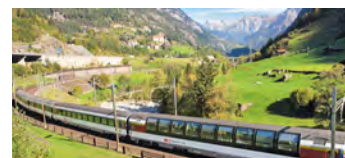
Train from Flüelen to the Ticino Canton