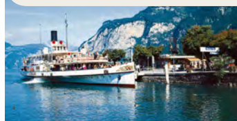
William Tell Express - Flüelen Steamer arrival

The train winds its way from 470 to 1100 metres altitude, disappearing into the 15-kilometre Gotthard Tunnel (which dates from the 19th century and took 10 years to build). The train re-emerges on the sun-kissed southern side of the Alps. In the summer season an accompanying guide provides interesting information on the Gotthard region.