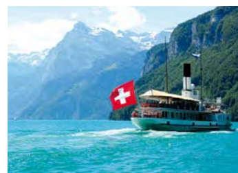
Wilhelm Tell paddle steamer, Lucerne to Flüelen

Child and Seniors rates on application. *Montreux Jazz Festival - 30 Jun -16 Jul 2016